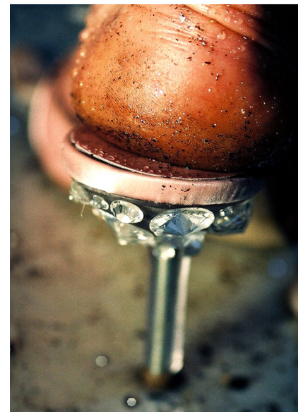
Marilyn Minter, Spiked , 2008 enamel on metal, 96 x 60 inches, Courtesy of the artist.